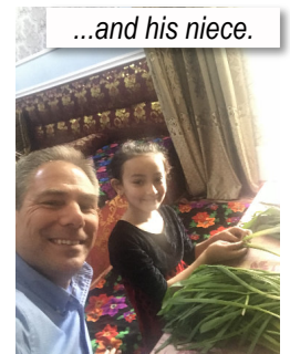
...and his niece.

I know this: God has given me a calling. To go and tell those that are far away, isolated, lonely, remote, and hard to reach, and tell them about the extreme love and salvation that is in Jesus, alone.