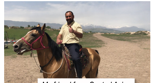
My friend from Central Asia...

I also found “her” on the Uzbekistan-Tajikistan border. I found “her” in Bolivia last fall, and in Iceland earlier this year. By faith I will find her in other far away places as God leads.